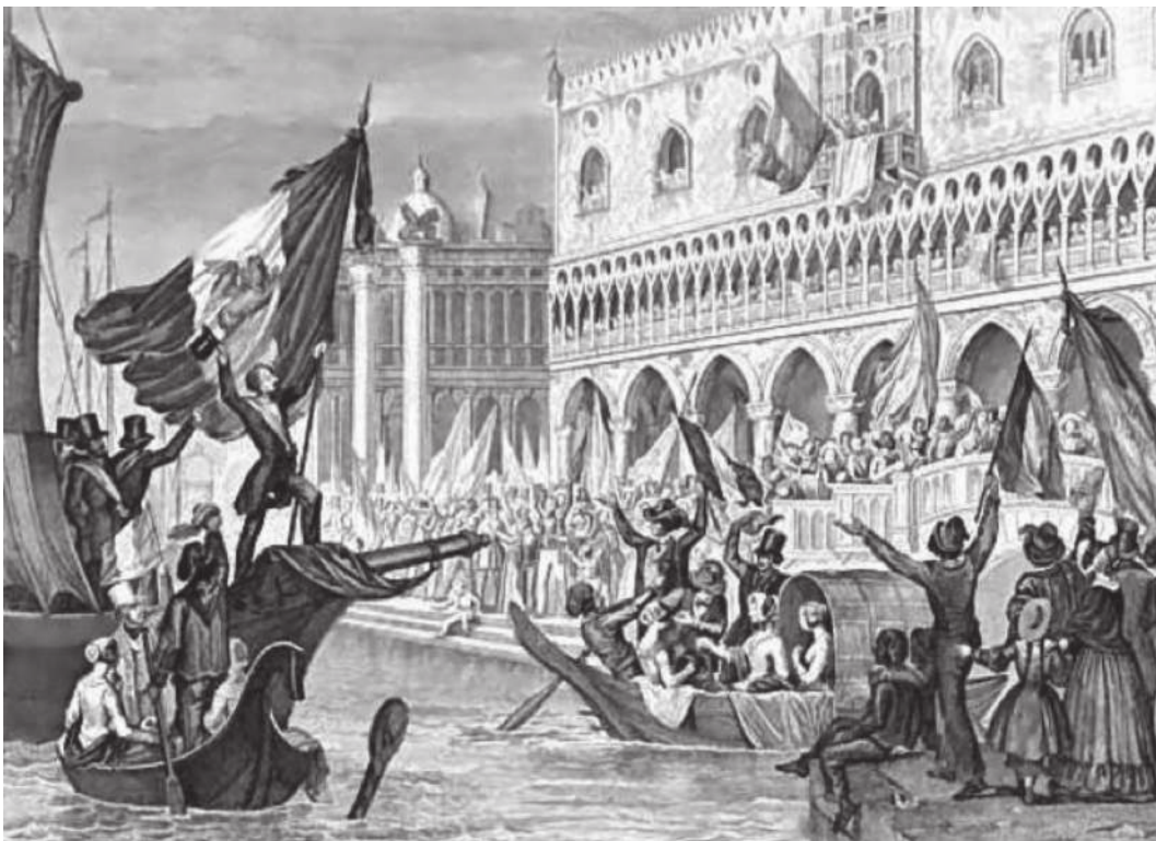
A drawing from the time of Daniele Manin proclaiming the Republic of Venice in 1848.