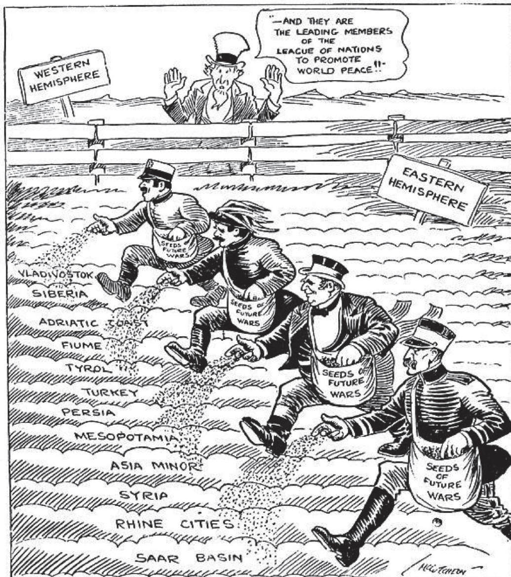
An American cartoon, 1920.