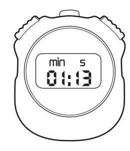
reading at end of first lap