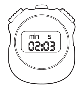
reading at end of second lap

What is the time taken for the runner to run the second lap?